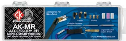
Replacement Parts Accessory Kit on Page 74

Micro Torch Kit (Part # AK-MR) included in torch package