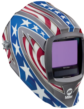
Stars and Stripes™ 280049