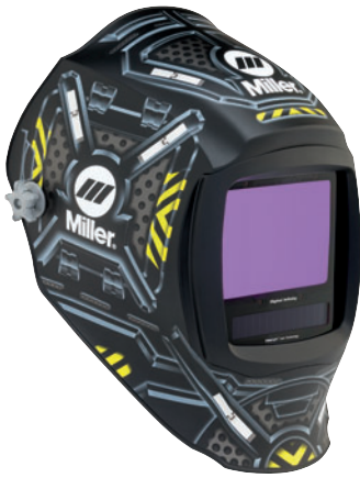
Black Ops™ 280047